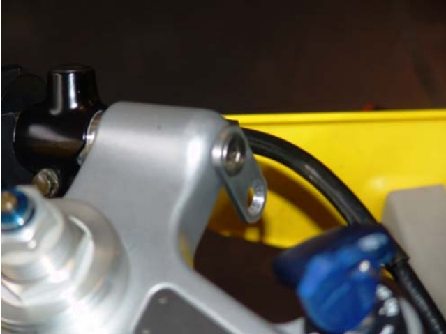
Bracket mounted to handle bar mount